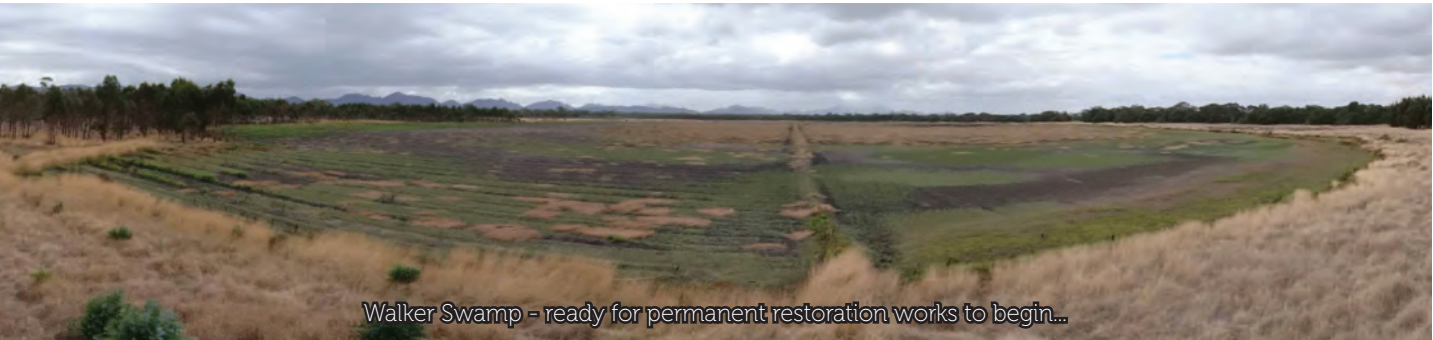
Walker Swamp - ready for permanent restoration works to begin...

The site will enable us to restore habitat for a wide range of threatened species such as: the Wimmera Bottlebrush (plant), Little Galaxias (fish), Growling Grass Frog (above far right), Western Swamp Crayfish and Australasian Bittern (bird), as well as a range of other important or iconic species, such as the Brolga and the White-bellied Sea Eagle (above right).