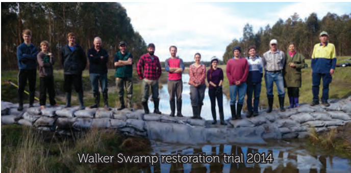
Walker Swamp restoration trial 2014

Walker Swamp and its surrounding floodplain is yet to benefit from permanent restoration - but we are confident of the site's potential, because of the success of a minor restoration trial NGT completed at Walker Swamp in 2014 (below).