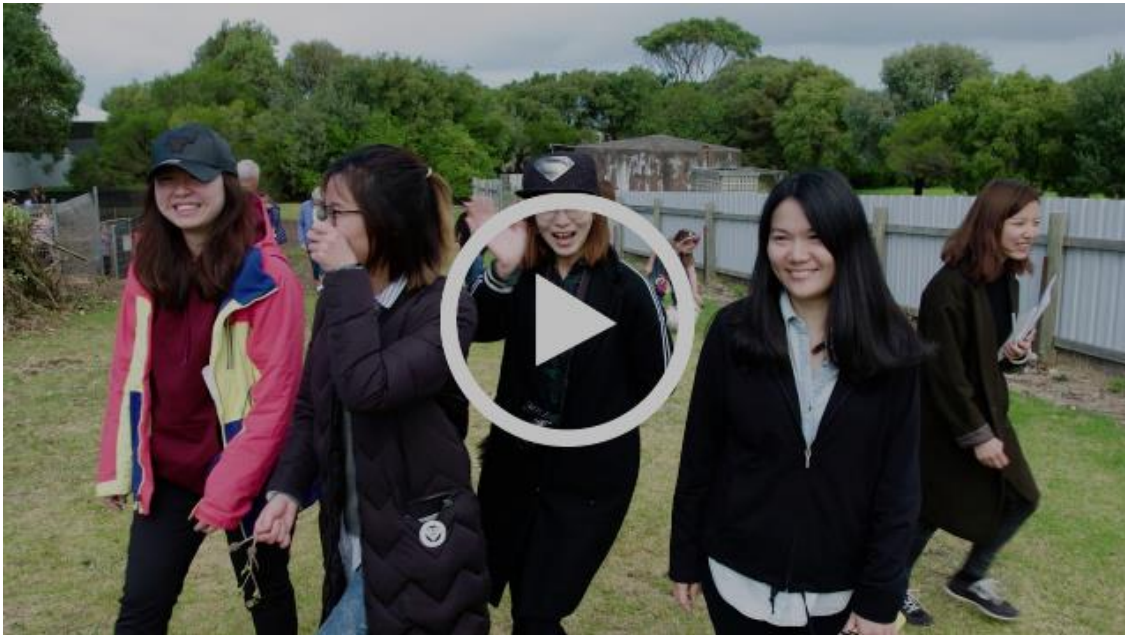
2017 Year in Review: Narrawong Kang-o-meerteek Small Town Transformation